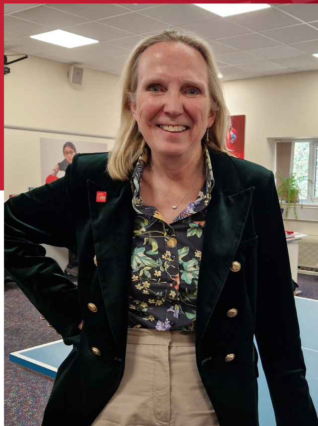
Table tennis is going from strength to strength with more than 450,000 people playing regularly in England; this happens because of extraordinary people in our team and across the wider table tennis community.

Our strategy, Table Tennis United, sets out an exciting journey of growth and transformation that underpins our purpose to 'host generations of players at our table', and towards our vision of 'a table tennis nation'.