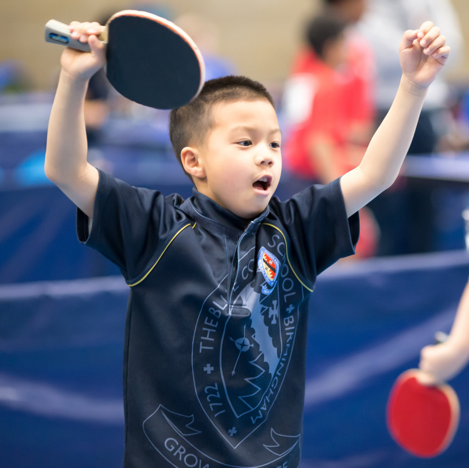
TABLE TENNIS ENGLAND INFORMATION PACK