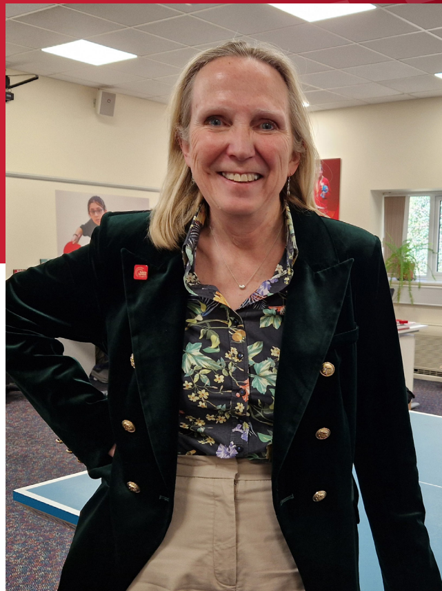
Table tennis is going from strength to strength with more than 450,000 people playing regularly in England; this happens because of extraordinary people in our team and across the wider table tennis community.

Our strategy, Table Tennis United, sets out an exciting journey of growth and transformation that underpins our purpose to 'host generations of players at our table', and towards our vision of 'a table tennis nation'.