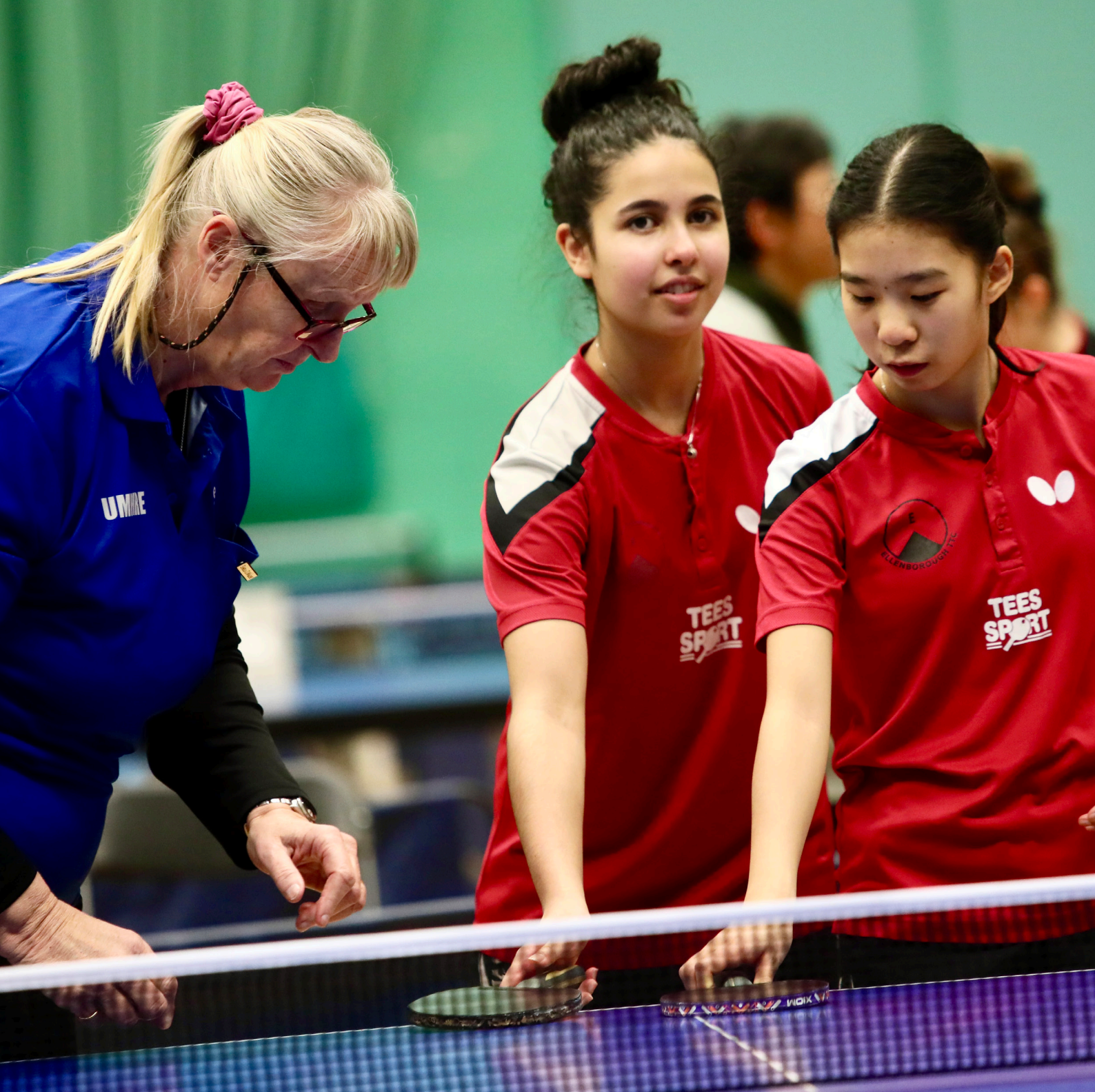
TABLE TENNIS ENGLAND INFORMATION PACK