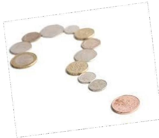
Table Tennis England do not make any charge and do not receive any of the admin fee.

If you are in a paid role then the charge is £36 plus the administration charge and £6.85 + VAT for the identity verification - all payable to Know Your People.