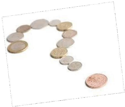
Table Tennis England do not make any charge and do not receive any of the admin fee.

If you are in a paid role then the charge is £36 plus the administration charge and £6.85 + VAT for the identity verification - all payable to Know Your People.