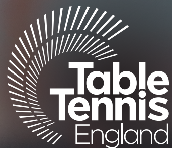
TABLE TENNIS ENGLAND RECRUITMENT PACK Coach Developer