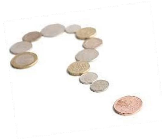
Table Tennis England do not make any charge and do not receive any of the admin fee.

If you are in a paid role then the charge is £36 plus the administration charge and £6.85 + VAT for the identity verification - all payable to Know Your People.