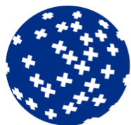
Table Tennis England does not financially benefit from using Know Your People in any way.

Table Tennis England do not accept DBS checks carried out through other registered bodies.