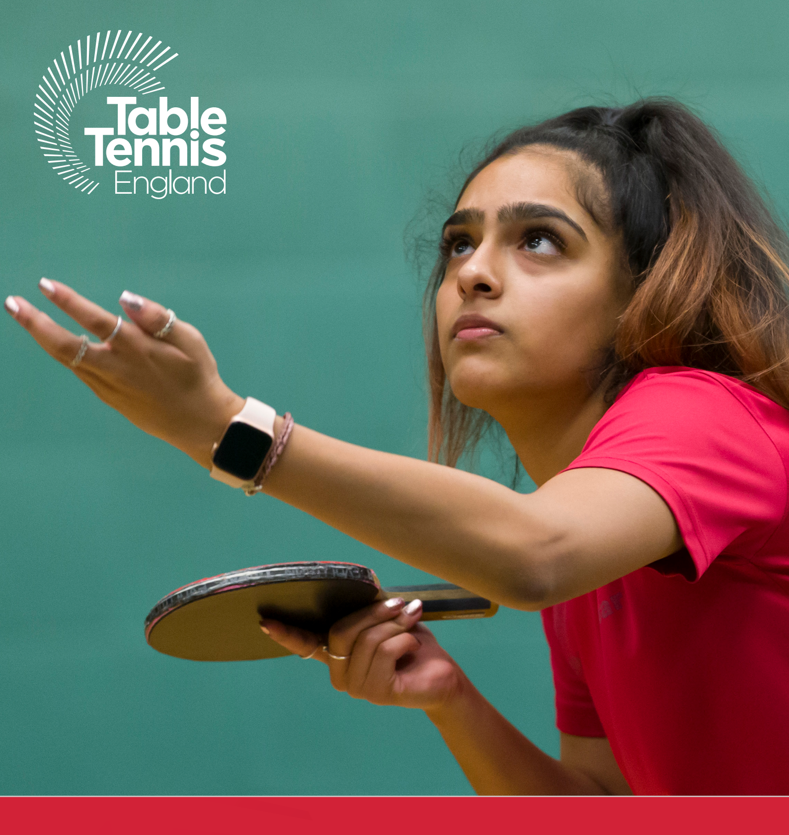
TABLE TENNIS ENGLAND VOLUNTEER RECRUITMENT

Local Organising Group Member North West Area