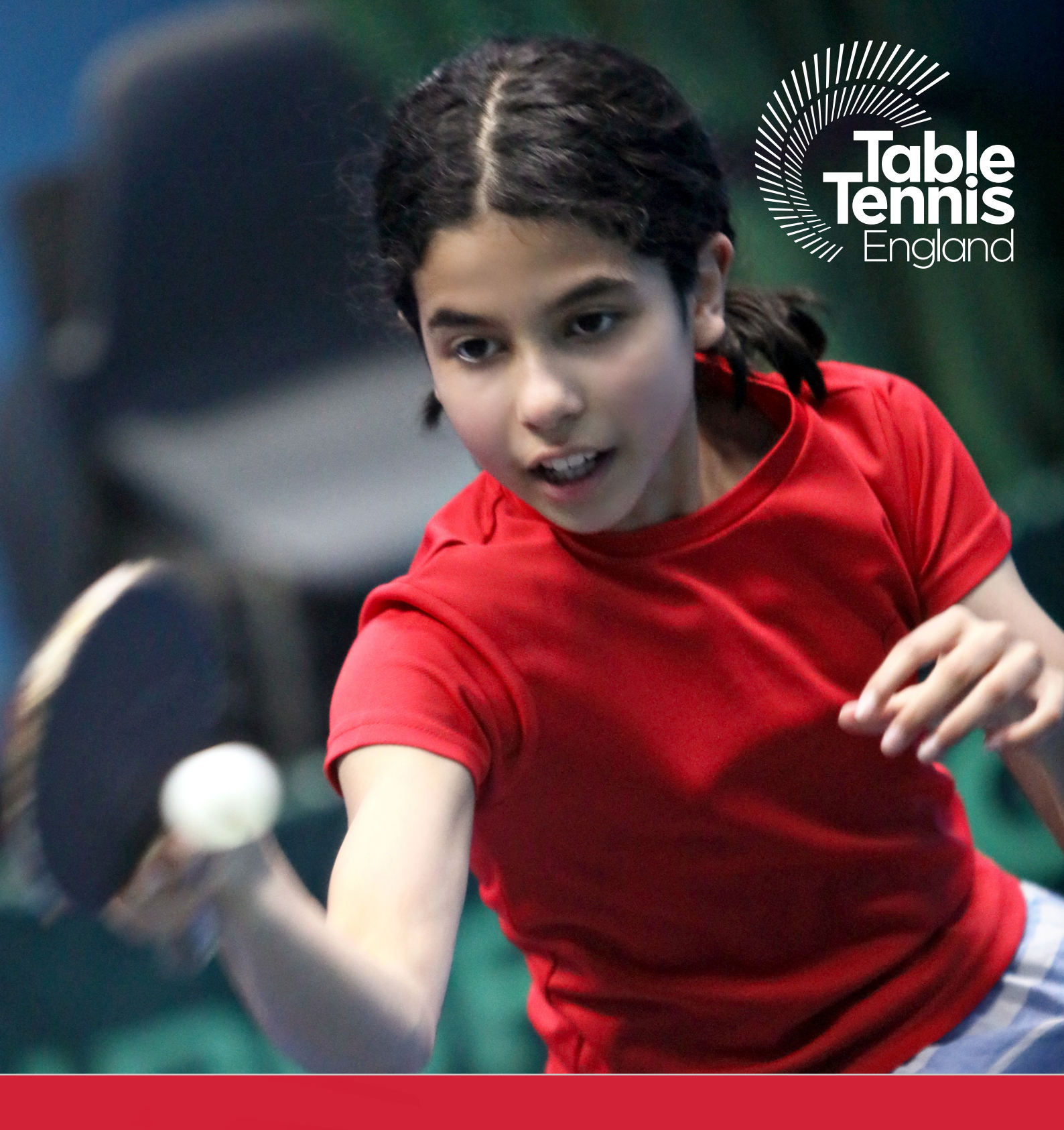
TABLE TENNIS ENGLAND VOLUNTEER RECRUITMENT

Local Organising Group Member North East Area