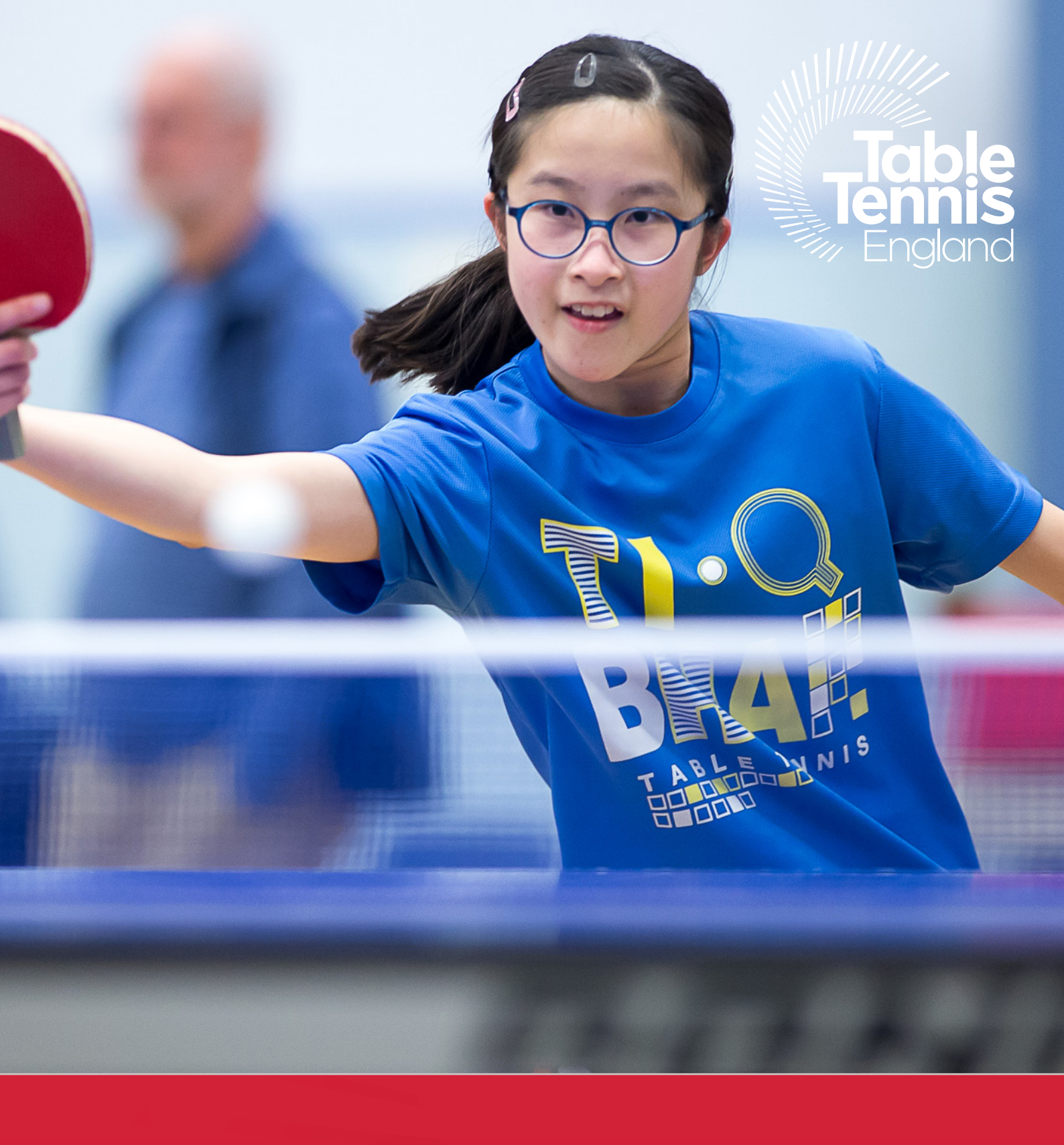
TABLE TENNIS ENGLAND VOLUNTEER RECRUITMENT

Local Organising Group Member London Area