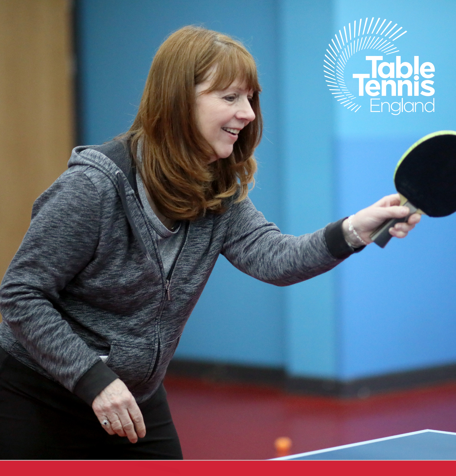
TABLE TENNIS ENGLAND VOLUNTEER RECRUITMENT Local Organising Group Member East Area