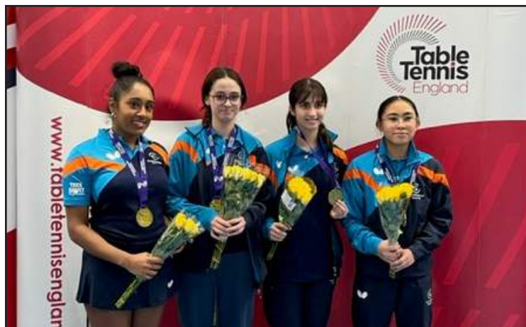
Division Four: Greenhouse