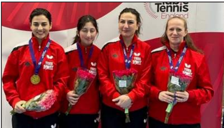
Division Three: Ellenborough Ladies