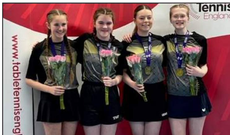
Division Five: Ackworth