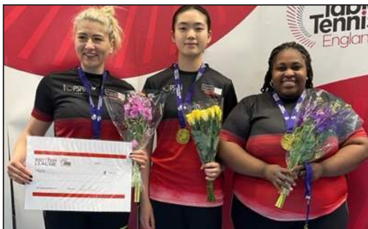
Premier Division: Fusion