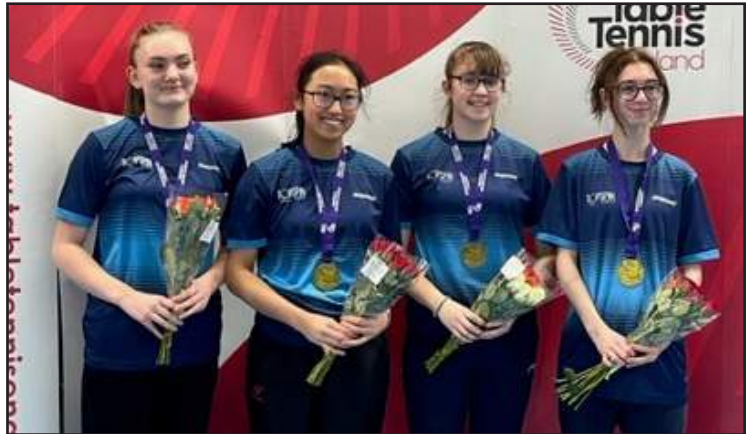
Division Two: Wensum