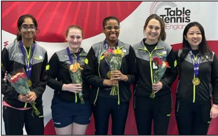
Division One: Fusion II