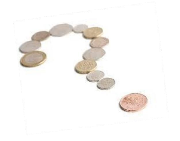
Table Tennis England do not make any charge and do not receive any of the admin fee.

If you are in a paid role then the charge is £36 plus the administration charge and £6.85 + VAT for the identity verification - all payable to Know Your People.