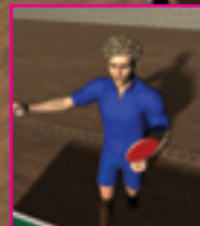
Winner on top table shouts change.