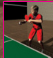
Two serves and change.