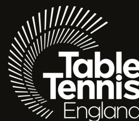
Table Tennis England Junior Umpire Award TEST PAPER